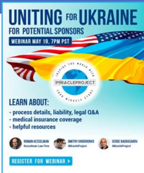
Webinar about Immigration process for Ukrainians

We've supported the journey of numerous refugees from Ukraine to Europe and the US. We've provided legal and transportation support and helped them find housing.