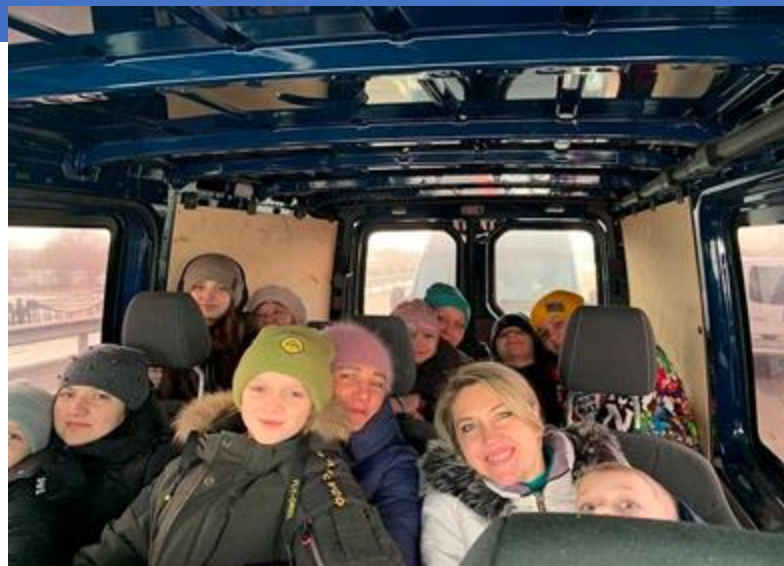
Evacuation from Lviv and other Ukrainian cities